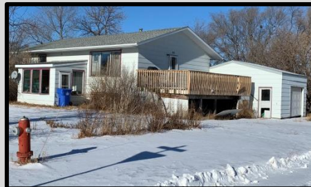
101 Anniversary Bay Lot 1, Block C, Plan 79R54879 Residential Lot Size: 69.5 feet x 171 feet (Corner Lot)

Property to be purchased in current condition and includes any contents currently on the property. To set-up an appointment to view the property, please contact the Town Office at 306-482-3300. Appointments will only be made during regular business hours and for interested parties only.