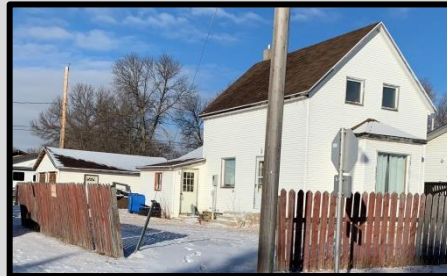
220 4 th Street East Lot 11, Block 13, Plan E1422 Residential Lot Size: 50 feet x 120 feet (Corner Lot)