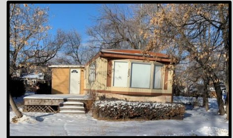
202 4 th Street East Lot 20, Block 13, Plan E1422 Residential Lot Size: 50 feet x 120 feet (Corner Lot)