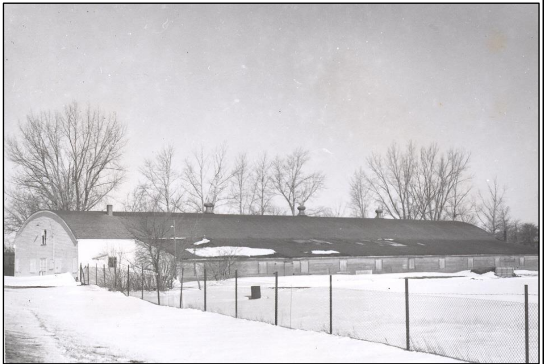
Rink (c. 1955)

The new rink, located where the Centennial Arena skating ice surface now sits, has become the final permanent home of skating and hockey in Carnduff. Originally it also included 2 sheets of curling ice. In 1954, the building was lengthened to include a waiting room and a furnace was added to the basement to warm skaters and curlers.