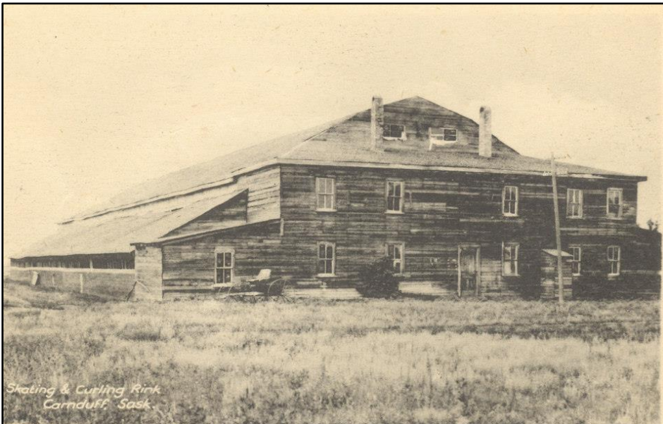
Rink (c. 1920)