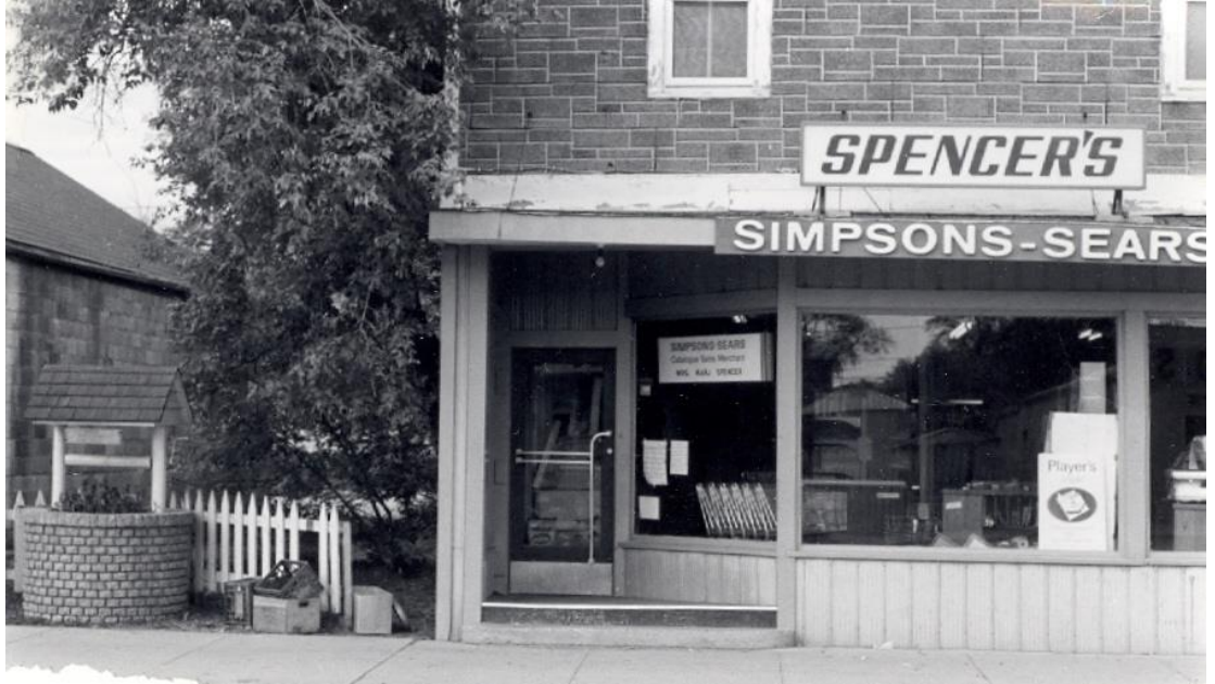
Spencer's (c. 1974)