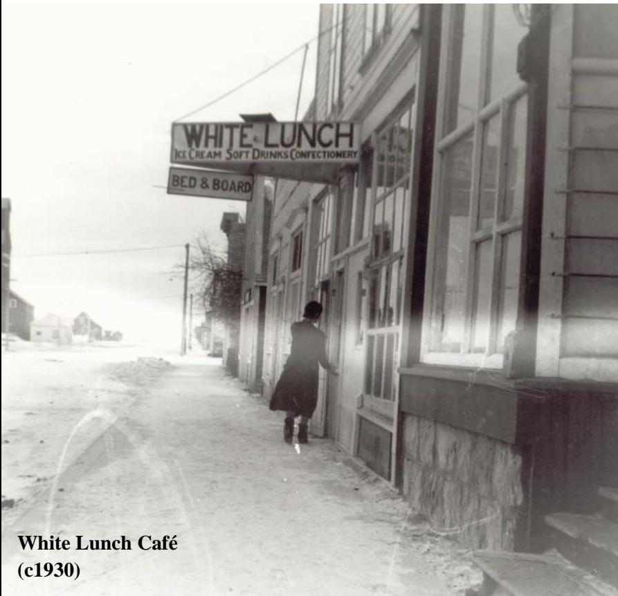
White Lunch Café (c1930)