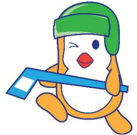
Figure Skating Club hits the ice again. For now, mandatory masking is our only public health guideline. Stayed tuned on our Facebook page for any updates to guidelines. The live Arena schedule can be found on the Town of Carnduff webpage under Rec Schedules, have a look! We can't wait to see everyone there.

November brings all Minor Hockey, the Red Devils and our